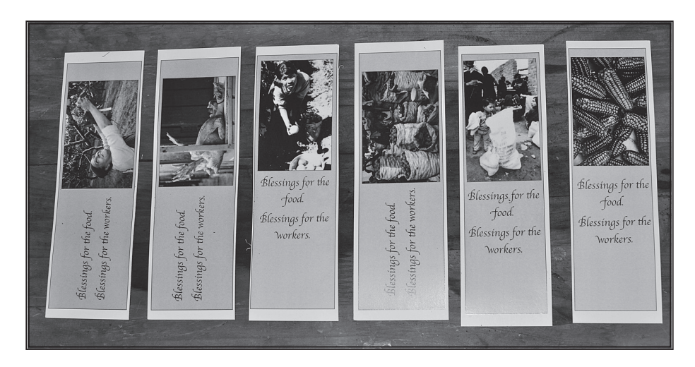
Prayer card photo

provide the text for the exhibit and reference many of the groups and analyses I've already noted above. Proclaiming on one side, "Blessings for the Food, Blessings for the Workers," they are organized by the six foods featured in the altars and migrant workers' stories. The reverse side elaborates on the historical domination of United States agriculture and the current corporate neoliberal model, on the struggle around corn sovereignty and potato biodiversity, and on the two migrant worker programs that are represented in the two altars. Finally, at the bottom of each card is the website of one group that is organizing around the issues discussed, from those mobilizing workers (Justice for Migrant Workers and the United Food and Commercial Workers) to those researching and leading campaigns ( Sin Maiz No Hay Paiz in Mexico and the Erosion, Technology, and Concentration group).