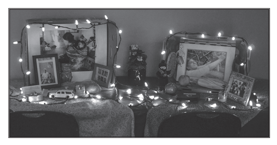
Original altars in boxes of the global imported food and local food program

The October 2012 showing was part of a Social Justice Conference at Ryerson University focusing on Decent Work, Decent Lives, and more particularly, was part of a day that I co-organized around "Local Food, Global Labour." A two-hour public panel invited two key migrant worker organizers (Justice for Migrant Workers and United Food and Commercial Workers) and two prominent food movement leaders (Toronto Food Policy Council and Food Secure Canada) to address the questions: How can we have both sustainable food and just labour? What is our organization doing to address the issue of migrant justice? The highlight of that gathering, attended by 100 students and activists, was emotional testimony by two surviving Peruvian workers, their first public appearance since the February accident. The public panel was followed by an afternoon workshop, "Building Alliances for Sustainable Food and Just Labour," explicitly bringing together 40 labour activists and food activists to explore points of tension and unity that would allow them to work together.